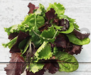
green/red oak lettuce