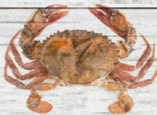
soft shell crab